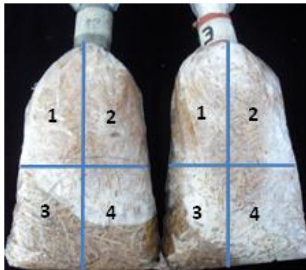
Figure 1. Superficial mycelia colonization in bags with substrate. 1, 2, 3 and 4 represent quadrants for the evaluation of percentage of colonization. Each colonized quadrant represents approximately 12.25% of bag superficial area.

Polypropylene bags (10 x 25 cm) containing 100 g of substrates poplar sawdust or wheat straw, were moistened to 70% (w/w) with