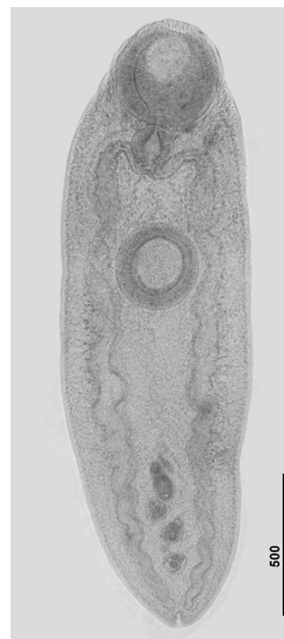
Figure 2. Metacercariae of Brachylaima sp. from the body cavity of Phyllocaulis variegatus (ventral view). Measurements are given in micrometers ( \mu\text{m} ).