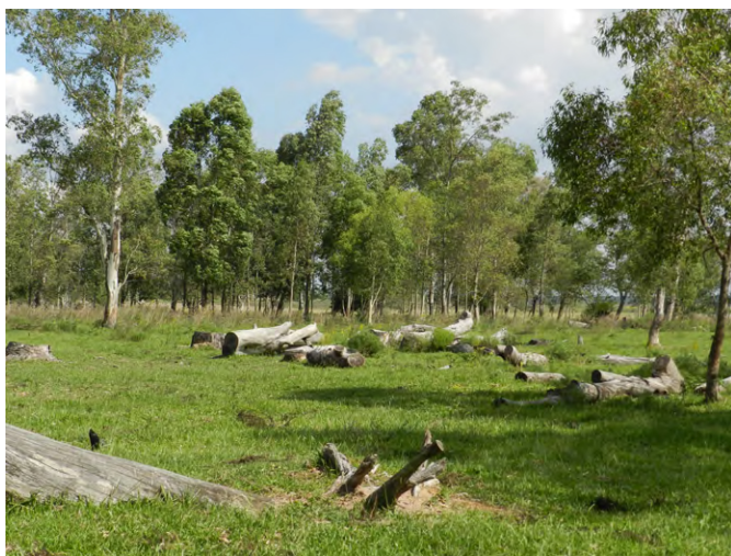
Figure 3. Sampling area, located in a private field near Alvear locality, General Alvear department, Corrientes province, Argentina.