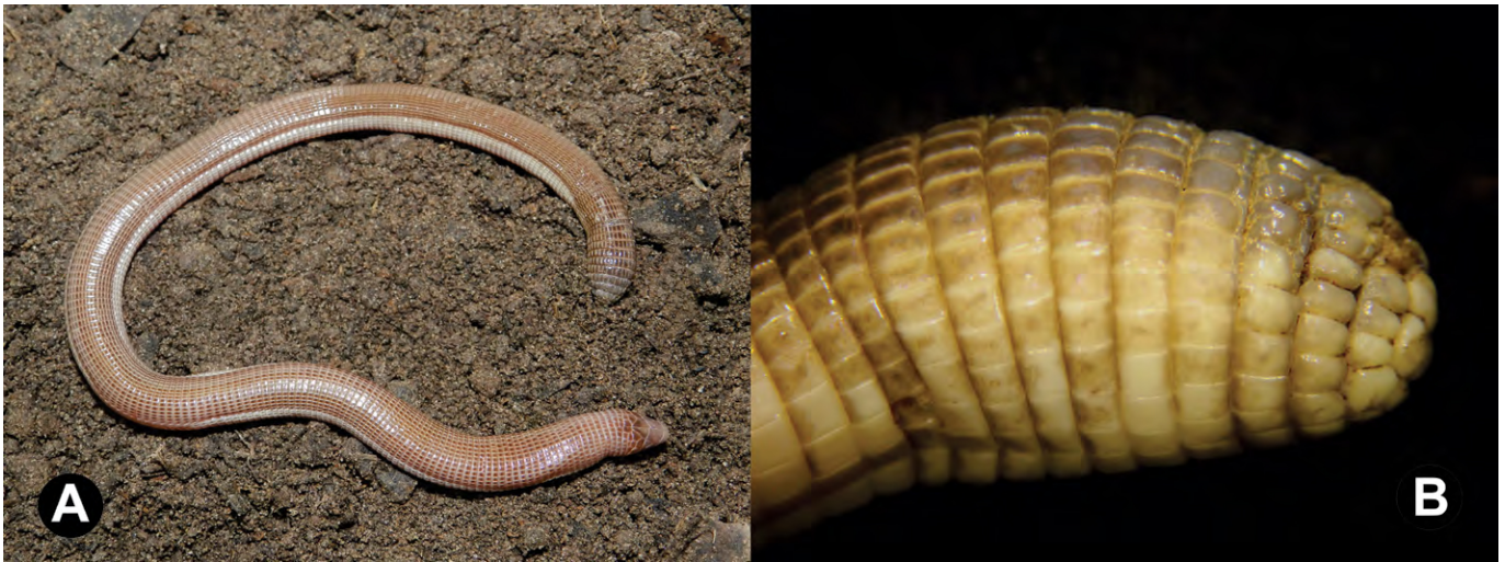
Figure 1. (A) Dorsal and (B) tail detail of a live adult specimen of Amphisbaena trachura (UNNEC: 12847) from General Alvear Department, Corrientes province, Argentina.