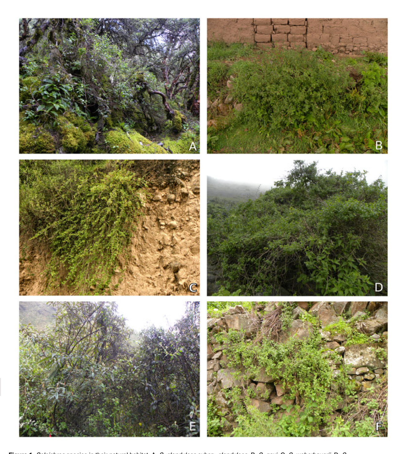
Figure 1. Salpichroa species in their natural habitat. A. S. glandulosa subsp. glandulosa. B. S. gayi. C. S. weberbaverii. D. S. ramosissima. E. S. didierana. F. S. microloba.