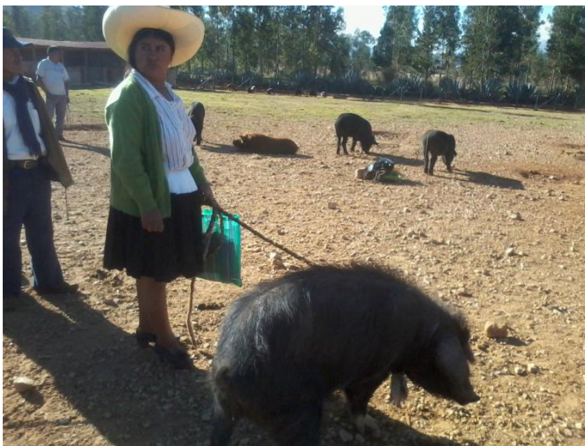
Typical image of animal handling by the poorest people in Peru