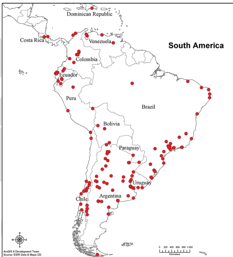
Fig. 1. The ECLAMC hospitals network in South America. Health professionals at 211 hospitals from 12 countries have participated in the ECLAMC network from 1967 to 2012 and have registered 153,085 malformed infants in 5,282,140 consecutive births examined.

As a birth defect surveillance system, ECLAMC systematically observes the frequencies of all malformations and, in the case of an alarm for a probable epidemic of a given malformation, at a given moment, and given area, it attempts to identify its cause. Since termination of pregnancy has severe legal restrictions in South America, birth defects prevention should be concentrated on primary (preconception) and tertiary (postnatal) level interventions.