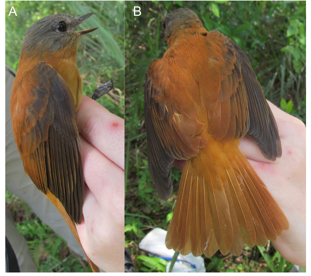
FIGURE 2. The Rufous-tailed Attila individual captured at Mburucuyá National Park after it was removed from the mist net.