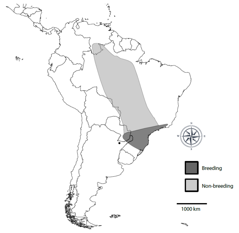
FIGURE 1. Distribution of the Rufous-tailed Attila ( Attila phoenicurus ). The point indicates the collecting site of the specimen reported here. Modified from BirdLife International and NatureServe (2014).

and ~31% of the species recorded for Argentina (Mazar-Barnett & Pearman 2001).