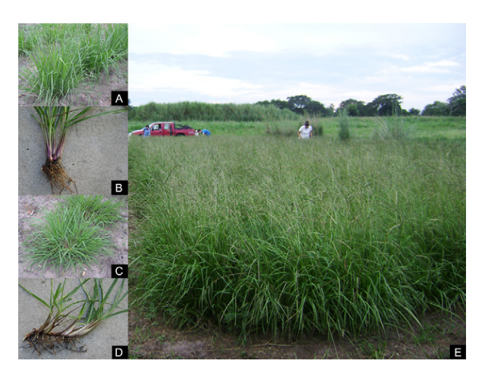
Fig. 2. Bahiagrass, Paspalum notatum . (A–B) Erect growing habit of Boyero UNNE. (C–D) Prostrate growing habit of wild-type bahiagrass (WTB). (E) Hand-harvesting seed of Boyero UNNE in an experimental stand at National University of the Northeast, Faculty of Agricultural Sciences (UNNE FCA), Corrientes, Argentina.

During the first year, all hybrids and controls produced approximately twice as much forage at Corrientes than at Chaco, probably due to inclement weather conditions—heavy