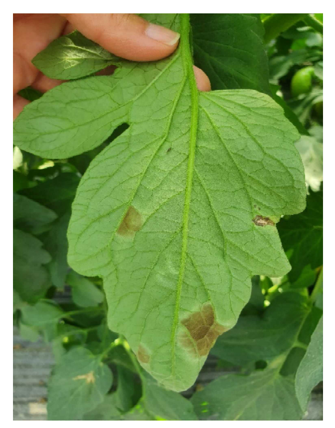
Fig. 1 : Tomato plants with symptoms of leaf mould disease

green mould on the lower leaf surface. As the disease develops, the spots become darker, leaves roll up, and defoliation may occur (Fig. 1). Hence, the photosynthetic area is diminished, which affects the yield and quality of fruits. P. fulva grows best at high temperature and relative humidity. Its primary dissemination method is wind, and it lives as a saprophyte on crop debris. Currently, disease control methods involve the application of fungicides (preventives and curatives), and among other agricultural practices, this guarantees crops protection (Obregón, 2018).