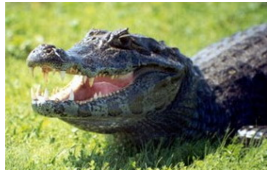
Figure 2. Caiman yacare

In diverse places of the world, scientific investigation is directed to the objective of accelerating the captive caymans growth speed, to make it more profitable the production. This implies finding appropriate diets in quantity of food, quality of their components and digestibility of the nutritious principles (Piña and Larriera 2002). The use of blood nutritional indicators, joined with the evolution of liveweight and corporal dimensions, can cooperate to the achievement of this objective. Obtaining the reference range for laboratory values also assumes importance to optimize the diagnosis of illnesses of reptiles in captivity (Ferreyra and Uhart 2001, Uhart et al. 2001).