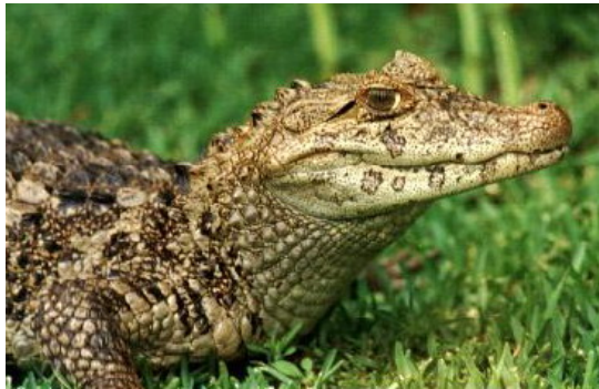
Figure 1. Caiman latirostris

Caiman latirostris and Caiman yacare (Figures 1 and 2) are two autochthonous species of crocodiles from the Alligatoridae family that inhabit the northeastern Argentina (Ferreyra and Uhart 2001). With the purpose of marketing the reptile leather and meat, hatcheries have recently proliferated in this area, they practice the ranching system. This procedure consists in inducing the hatching of eggs gathered from the natural environment, and rearing the caymans under controlled conditions until reaching commercial size for its slaughter and sale. The return to their environment of the dear percentage of animals that had survived under natural conditions is an important aspect of this exploitation system (Waller and Minucci 1993, Prado et al. 2001).