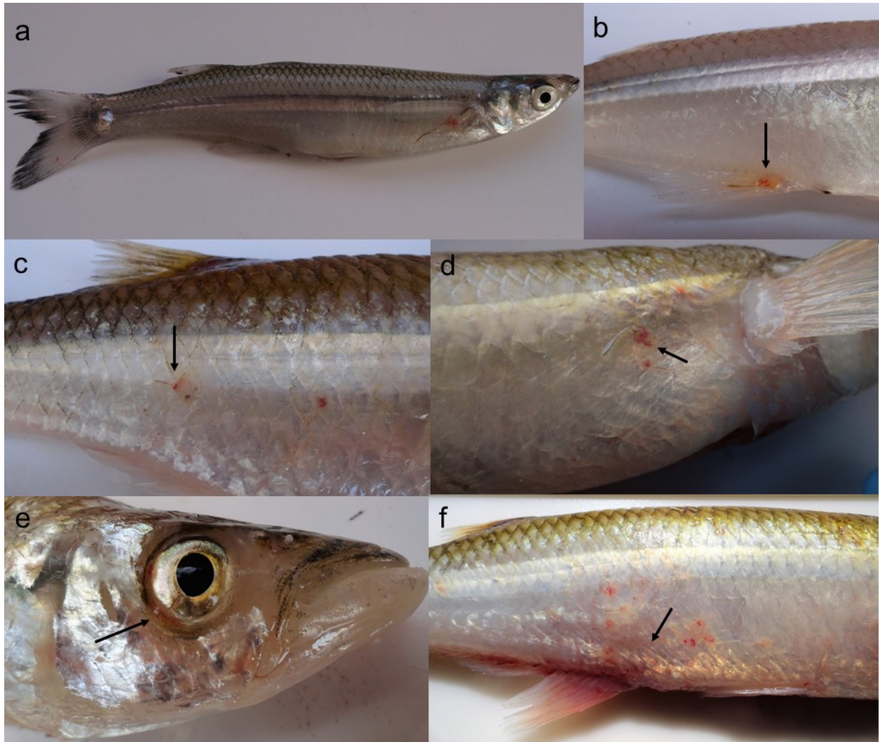
Figure 3. Image of a specimen of Odontesthes bonariensis (a); Lernaea cyprinacea in the base of the anal fin (b); at the level of the stole (c); next to the pectoral fin (d) and the eye (e); superficial hemorrhages in an individual with high parasitic intensity (f).

al. 2016a). In this study, the presence of the copepod increases with the size and age of the silverside, unlike what happens in several cyprinid species where no significant relationship was found between these variables (Raissy et al. 2013), as well as in the brown trout ( Salmo trutta , Linnaeus 1758) according to what was expressed by Sánchez-Hernandez (2011). Innal et al. (2017), also found no significant differences in the prevalence and intensity of L. cyprinacea among different ages in various fish species in the same environment, perhaps due to the size of the samples of each species analyzed.