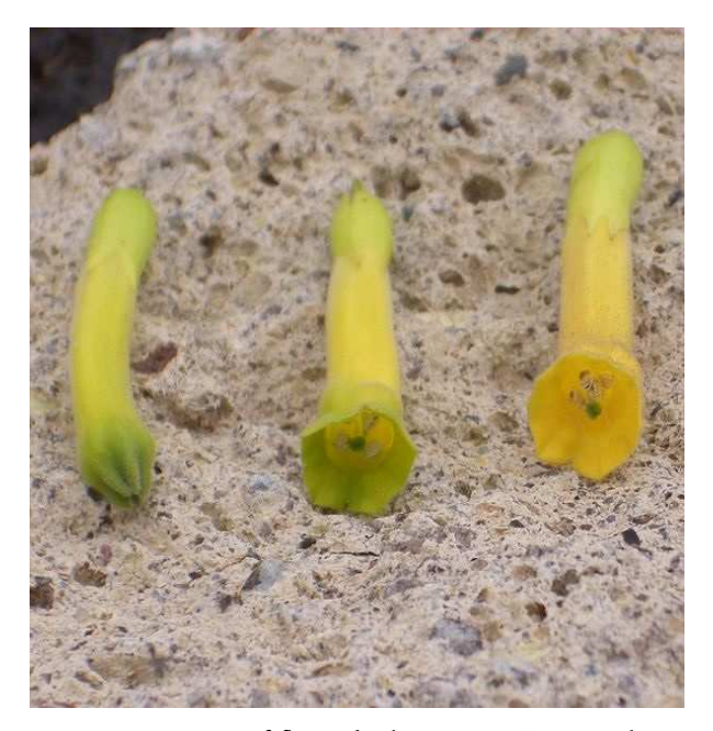
FIGURE I: Stages of flower development in Nicotiana glauca . From left to right: closed late stage bud; newly opened flower; older flower showing colour change of mouth of corolla tube from green to yellow. Photograph by Jeff Ollerton in an invasive population on Tenerife.

populations of northwest Argentina, a flower colour polymorphism is present which includes dark red, reddish yellow and yellow morphs.