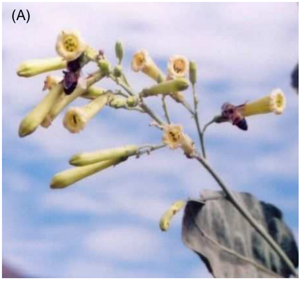
Figure 2: (A) Flowers of Nicotiana glauca being netar

Finally, one population was surveyed for nocturnal visitors, particularly large night-flying moths, on three evenings. This population was chosen because of the presence of larvae of the Barbary spurge hawkmoth ( Hyles tithymali tithymali ) feeding on Euphorbia broussonetii , indicating that these potential pollinators were present in that community. As well as checking flowers with flashlights, we added fluorescent dye powder (see Kearns &