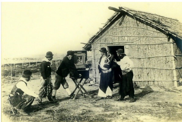
Figure 2 Ayerza. The phonograph c. 1895.

In its first decade, the SFAA promoted so-called national photographs, images that represented the country’s landscapes, customs, traditions and material progress, seeking to spread an optimistic vision of the country’s future (Figure 2). However, although the SFAA had members outside of Buenos Aires, the vast majority of the material was about it. 9