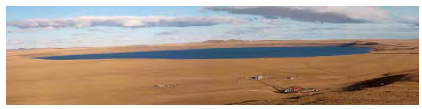
Figure 1. Overview of Laguna Potrok Aike from prominent basalt escarpment. This 770 ± 220 ka old maar lake is located at approximately 52°S, 70°W in Santa Cruz province, southern Patagonia (Argentina). Lake elevation = 113 m, depth = 100 m, and diameter = 3.5 km.

The workshop continued with twenty-five additional talks subdivided into eight topical sessions. The first session focused on the ICDP with regard to funding and support, technical aspects of using the GLAD 800 system, and first-hand experiences of the Petén-Itzá Drilling Project (see report in this issue on page 25). The operations of this ICDP lake-drilling project were accomplished only a few days