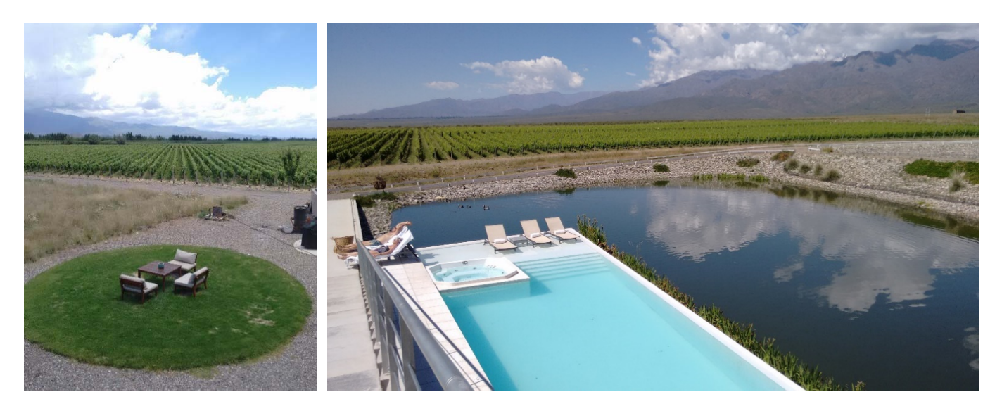
Figure 2: Wine resorts at Tunuyán, Uco Valley.

Argentina's wine routes, an itinerant tourism program around which all tourism products from the Uco Valley are coordinated, comprise a broader proposal "around a storyline related to local or regional heritage" (Girini 2005: 2). The Uco Valley has now consolidated its productive profile around agriculture and has become one of the main wine tourism destinations worldwide (INV 2016). Productive activity and the job market have been rearranged by newly established vineyards, the establishment of foreign companies interested in relocation and foreign investment, and infrastructure development. In order to articulate, promote and sell wine tourism products in relation with wine production, the ventures in Mendoza's luxury sector resort to a set of images that resemble a dreamlike postcard. Thus, wine capitalism produces not only its space, but also its representations (Lefebvre 2013). Localized "nature" is presented-represented by means of a visually anchored strategy: the view of vineyards and the mountain range (Figure 2).