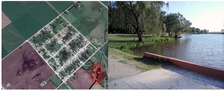
Figure 1 (A) Colony San Miguel, Olavarría, Buenos Aires province, Argentina. (B) Recreational area of Nievas stream.