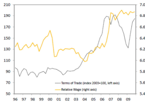
Figure 1. Terms of Trade vs. Relative Wages